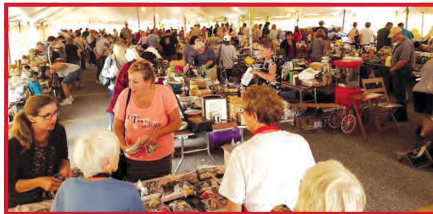
All of the traditional Applefest features, including a craft bazaar and farmers market, await guests at Applefest 2023.