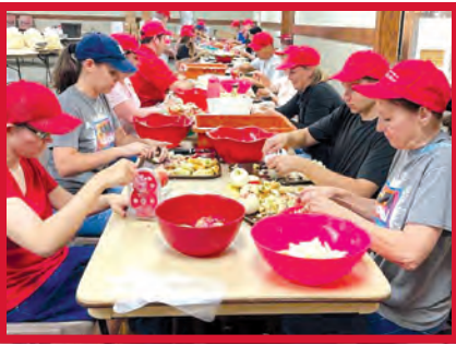
A team of apple pie makers peel, core and slice apples for Applefest pies. Submitted photos