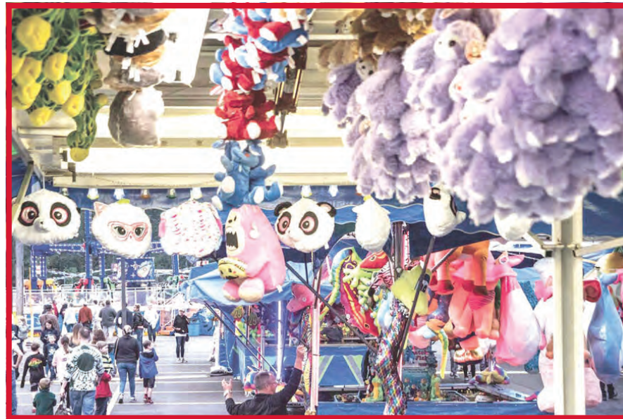
The midway returns with tons of fun for the entire family at the 2023 St. John the Evangelist Catholic Church's Applefest beginning Thursday, Sept. 14.

The Apple Pie Judging and Auction beings at 2 p.m. on Sunday, Sept. 17.