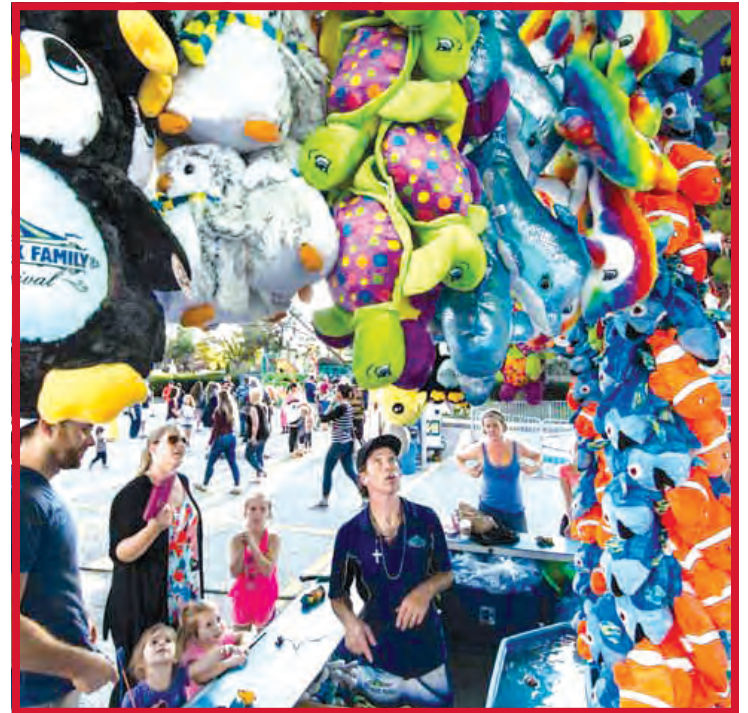
An employee of Skerbeck Family Carnival looks for the next prize to select for a player at the "Fishin' Hole" at a past St. John Applefest.