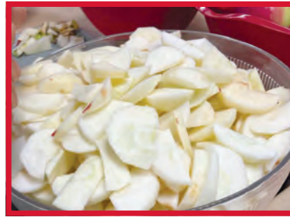
These sliced apples are the main ingredient in the apple desserts that will be available at this year's Applefest.