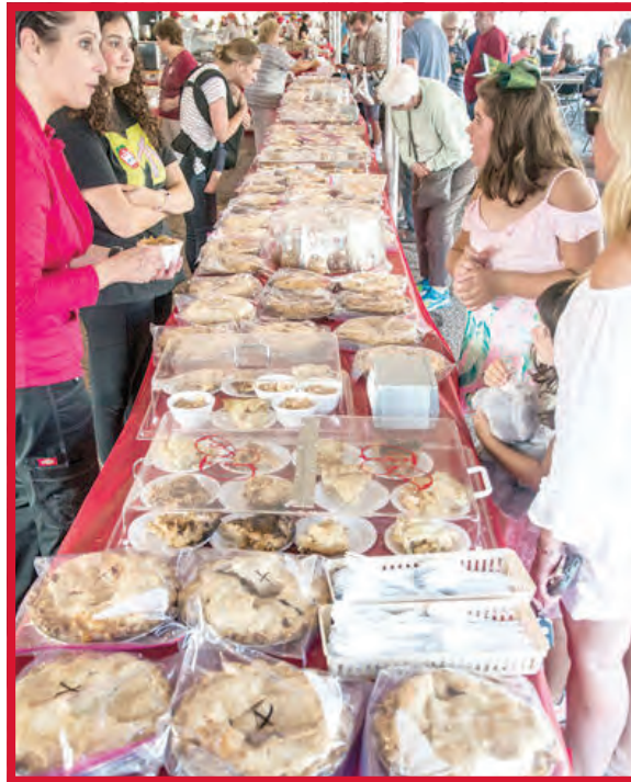
The 51st annual St. John the Evangelical Catholic Church's Applefest in Fenton is known for apple pies, apple desserts and the famous auction.