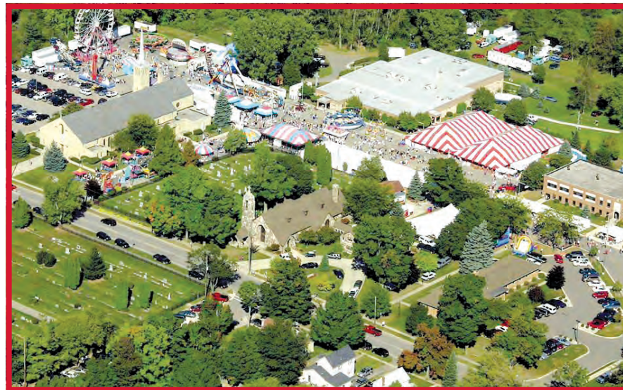
This aerial photograph of St. John's Applefest in Fenton by Skerbeck Family Carnival shows the expansive layout of the annual festival.