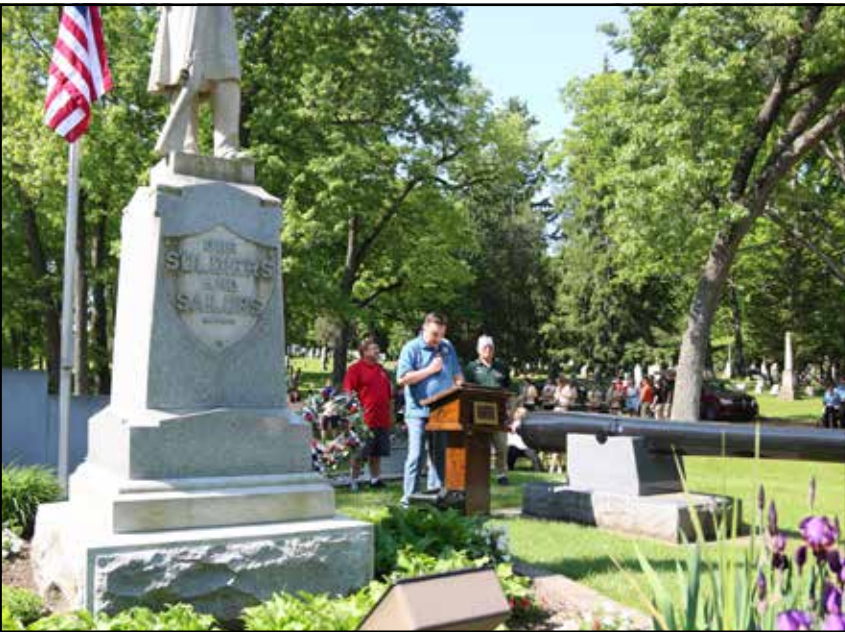
The Fenton VFW conducts a memorial ceremony at Oakwood Cemetery on Monday, May 30 for Memorial Day to honor those who died in military service for the U.S. See full story on page 3.