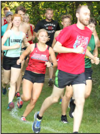
Some Linden High School runners and some alumni runners begin their 5K on Saturday at Linden Middle School.