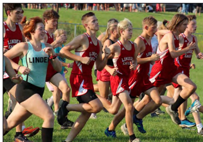
Linden cross country runners start Saturday's alumni race. The event had about 25 graduated Linden runners.