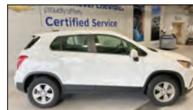
2018 CHEVROLET TRAX LS Stk#1350561A..... $15,985