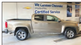
2016 CHEVROLET COLORADO Z71 Stk#1147660A..... $21,015