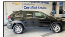
2017 JEEP CHEROKEE LATITUDE Stk#1313576B..... $15,500