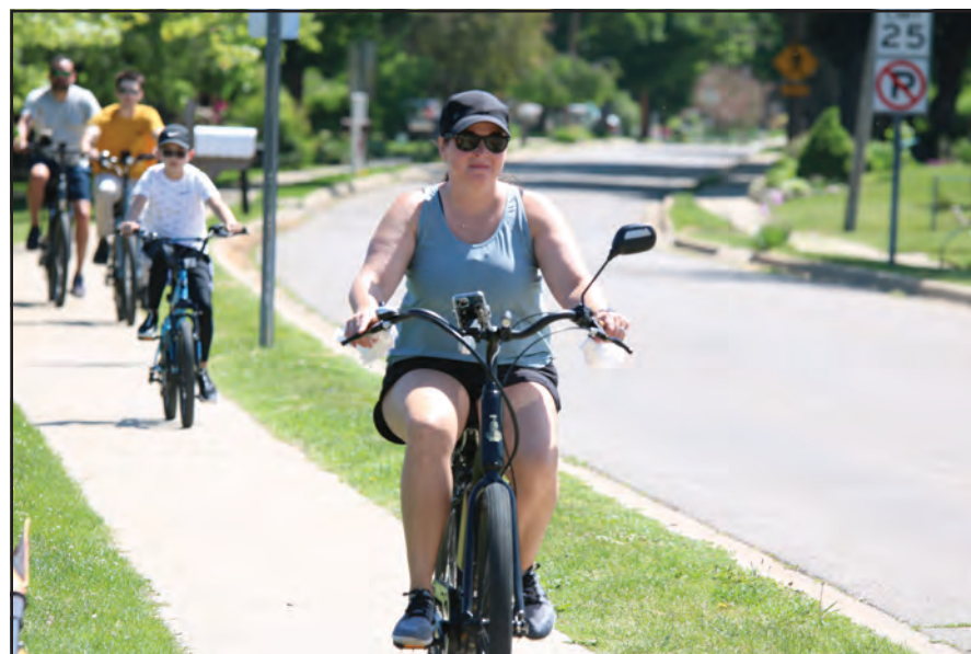
Families biked along Linden sidewalks and the new pathway in Argentine Township during the Paddle & Pedal event.