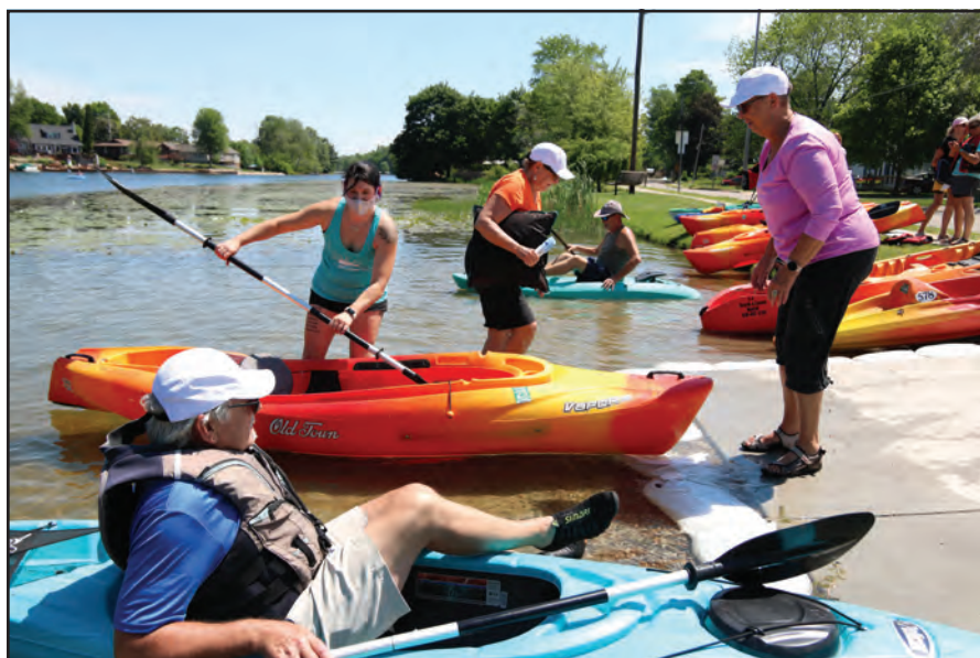
A participant of the inaugural LAFF Paddle & Pedal gets out of his kayak at the new launch pad on the Shiawassee River near the Linden Library on Saturday, June 5.