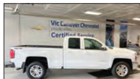
2019 CHEVROLET SILVERADO 1500 LD LT Stk#1125705A..... $33,403