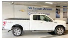
2018 FORD F-150 XLT Stk#126050A..... $34,351