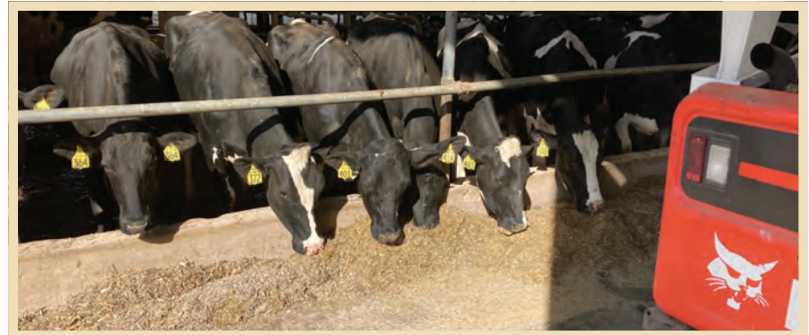
Cows at the Gramer Farms in Deerfield Township eat feed, which is grown on the family’s farm. Submitted photo