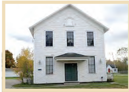
The Atlas Grange Hall on Perry Road in Atlas is on the National Register of Historic Places.

The grange definition and system was modified when the concept was brought to North America. After the Civil War in the United States, Oliver Kelley, the commissioner of the Department of