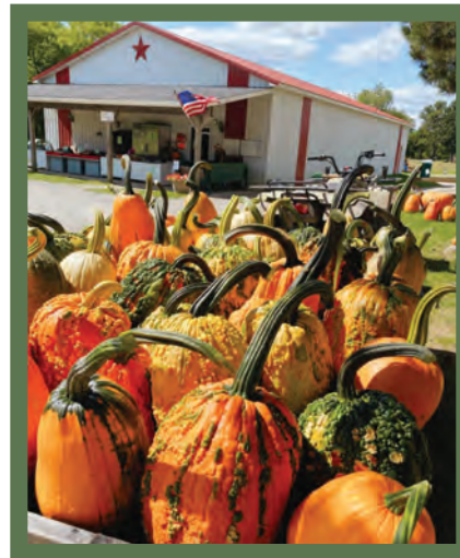
A hearty and colorful display of extra long handled pumpkins can be seen from the road as you drive by Eichelberg Farm in the fall.