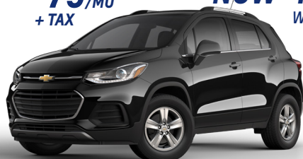
2020 TRAX LT FWD