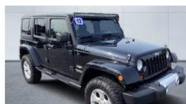
2013 JEEP WRANGLER UNLIMITED SAHARA