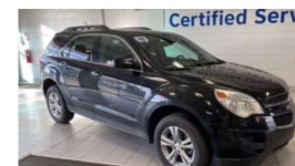
2015 CHEVROLET EQUINOX LT 1LT