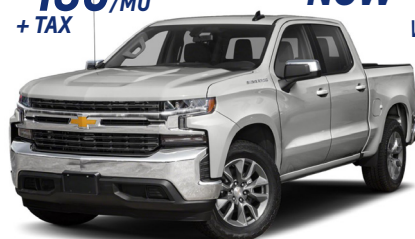
2021 SILVERADO CUSTOM CREW CAB 4X4