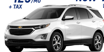
2021 EQUINOX LT FWD