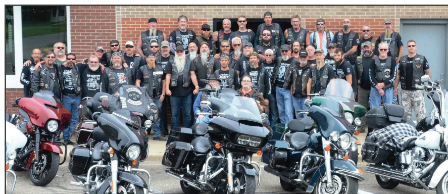
The Barons Motorcycle Club is at 101 Genesee St., in Gaines. They are hosting a blood drive with the American Red Cross on Jan. 30.

Masks are expected and required for donation to ensure the safety of donors and staff because of the COVID-19 pandemic.