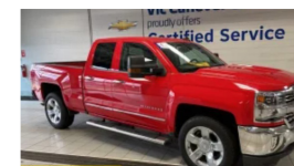
2017 CHEVROLET SILVERADO 1500 LTZ 1LZ