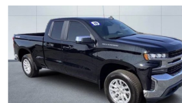
2019 CHEVROLET SILVERADO 1500 LT