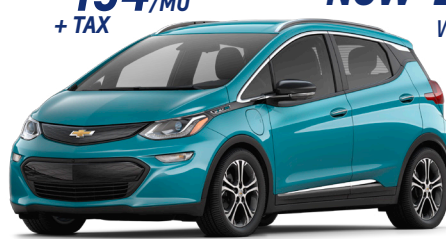
2020 BOLT EV PREMIER

BUY NOW $26,988 WAS $44,355 SAVE $17,367