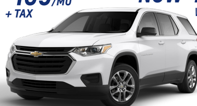
2021 TRAVERSE LS