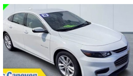
2016 CHEVROLET MALIBU LT 1LT