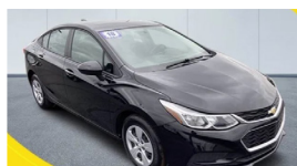
2018 CHEVROLET CRUZE LS