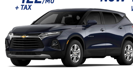
2021 BLAZER LT FWD