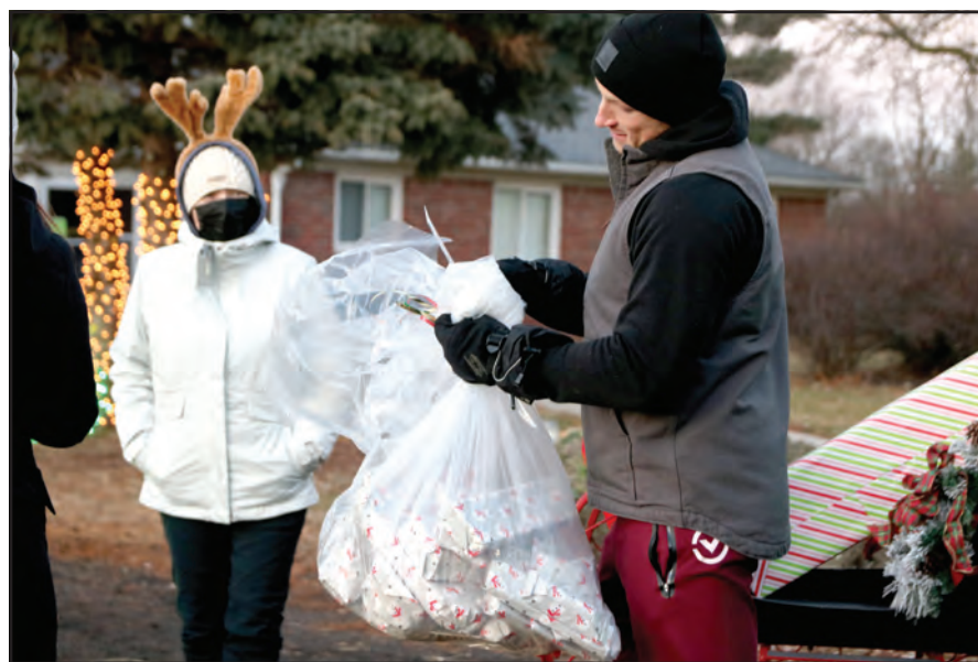
A Fenton Center of Hope volunteer takes a bag of presents to a vehicle on Sunday, Dec. 20.

People just gave overwhelming support. It was a great community thing," she said.