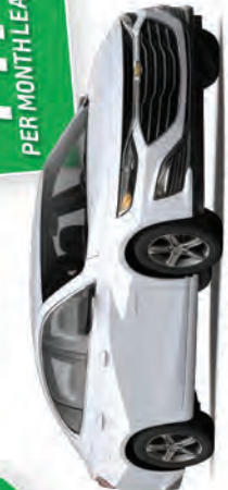
2020 MALIBU LS STK# 6076398

Fenton's ONLY GM Authorized Chevrolet Dealer