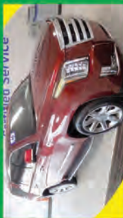
2016 CADILLAC ESCALADE LUXURY STK# 180562 $44,900