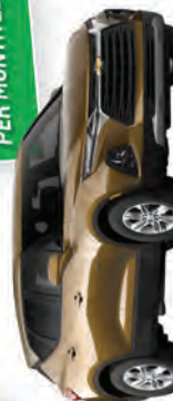
2020 BLAZER 2LT FWD STK# 1601952T