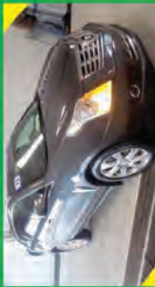
2013 CADILLAC SRX PERFORMANCE STK# 14145317A $14,700