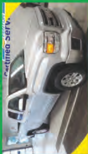
2014 GMC SIERRA 1500 SLE STK# 1136410A $15,600

Bring this coupon in to your sales person, and receive