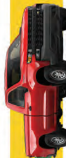
2019 SILVERADO REG CAB 4WD STK# 1288406

WAS $39,635 NOW $29,674 35 SAVE $9,960 64