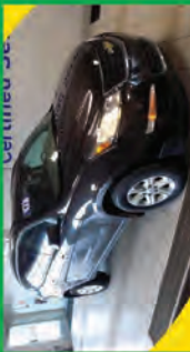
2017 CHEVROLET TRAVERSE LS STK# 180811 $15,800