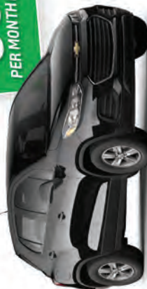
2020 TRAX LS STK# 1071264