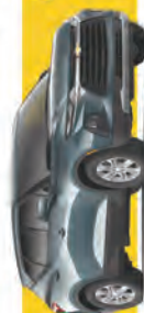
2019 BLAZER 3LT LEATHER STK# 1674495

WAS $39,635 NOW $29,674 35 SAVE $9,960 64