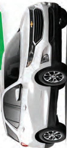
2020 EQUINOX LT DEMO STK# 1106377