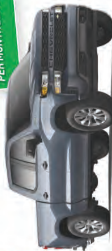
2020 SILVERADO CREW CAB CUSTOM STK# 1187925

Vic Canever GREEN TAG SALES EVENT SAVE THOUSANDS now through March 31st!