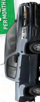
2020 COLORADO CREW CAB 4WD STK# 1111093