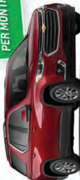
2020 TRAVERSE 1LT DEMO STK# 1110802