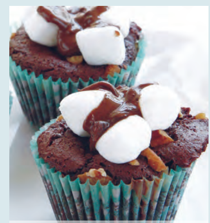
Fudgy cupcakes are a gooey masterpiece

Bake an additional 1 minute. Gently swirl melted chocolate kiss to "frost" each cake and hold marshmallows in place. Cool in pans on wire racks 10 minutes: remove from pans.