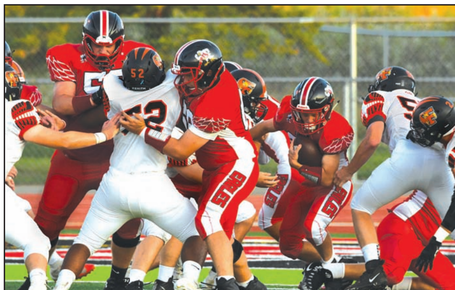
Linden's offensive line opens up a hole during the Eagles' 42-35 loss to Flushing.