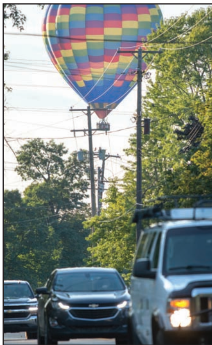
A hot air balloon from Balloon Quest of Holly Township hovers near Silver Lake Road in Fenton on Sept. 16. This balloon landed in a field in the Silver Lake Hills apartment complex.

"This is one of those crashes where had it not been for the vehicle's safety devices this person probably would not have survived," Lintz said.