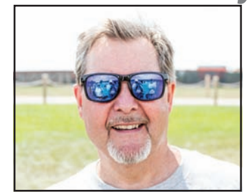
"All of the friends and wonderful people that you get to know. You have friendships that last forever."