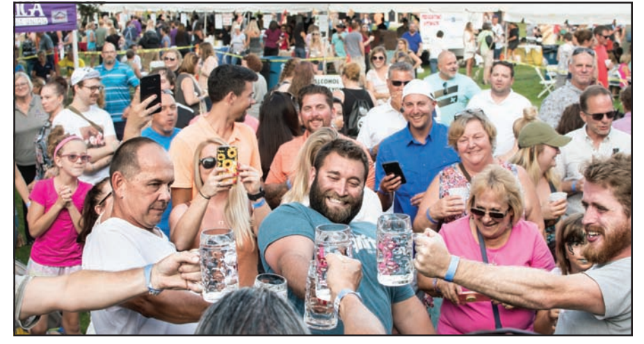
The grassy park, nestled along the Shiawassee River behind the Fenton Community and Cultural Center, is a popular location for outdoor festivals.

The site was cleaned up and is to The Community Center was built for