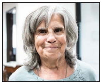
"Prom. I went to five. I went to the Lapeer prom with a guy I didn't even know. Out of all my proms that was the most fun."