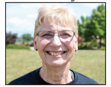
"My friends were my favorite. We're still friends to this day."