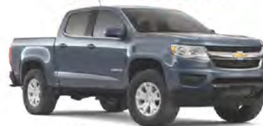
2019 COLORADO W/T CREW STK# 1336371