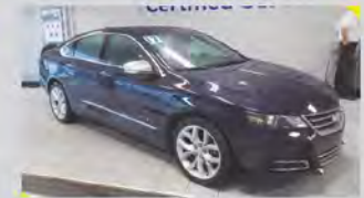
2017 CHEVROLET IMPALA PREMIER 2LZ $19,970 Stk# 180649

GET THE BEST PAYMENT PERIOD WWW.CANEVER.COM