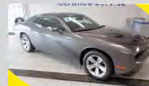
2016 DODGE CHALLENGER SXT $17,620 Stk# 1357129A