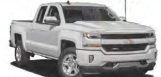
2019 SILVERADO DOUBLE CAB CUSTOM 4X4 STK# 1198017

Lease prices are based on 10,000 miles/yr, 24 months, prices are based on GM Employee discount, gm lease loyalty/loyalty move up offer and or Silverado/Sierra private offers. Due at signing $3,000 down payment, 1st lease payment, sales tax, title, plate and dealer doc fees. Offer expires 7/31/19. See dealer for details and your best possible price!