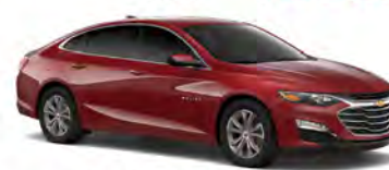
2019 MALIBU RS STK# 6193588