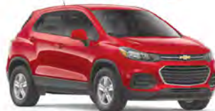
2019 TRAX LS AWD STK# 1337610