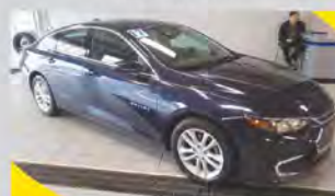
2017 CHEVROLET MALIBU LT 1LT $15,700 Stk# 180643