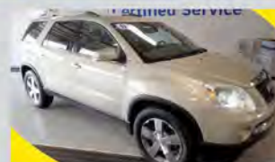
2011 GMC ACADIA SLT-2 $7,304 Stk# 180584B

Mon, Tues & Thurs: 8:30am - 8pm Wed & Fri: 8:30am - 6pm Saturday: 10am - 4pm Sunday: CLOSED