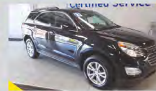
2017 CHEVROLET EQUINOX LT 1LT $16,299 Stk# 180645