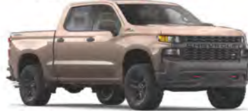
2019 ALL NEW SILVERADO CREW 4X4 1LT STK# 1110825