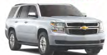
2019 TAHOE LS STK# 1367800