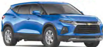
2019 BLAZER 1LT STK# 1672315