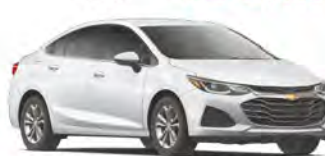
2019 CRUZE LT STK# 8142999