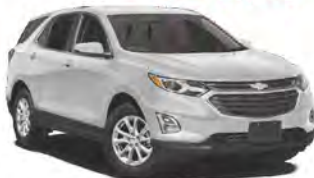
2019 EQUINOX LS STK# 1304559