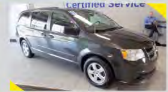
2011 DODGE GRAND CARAVAN EXPRESS $6,493 Stk# 1313760B