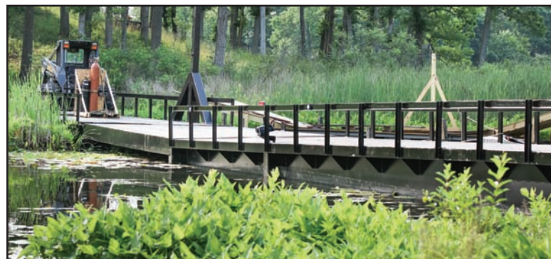
This black bridge, which is approximately 10-feet wide, spans the length of a channel between Turtle Island and property on Whitehead Drive, going over lily pads and other wetlands.

"We are just beginning our investigation of the matter and so have not made any decisions regarding the proper course of action under the NREPA," he said.