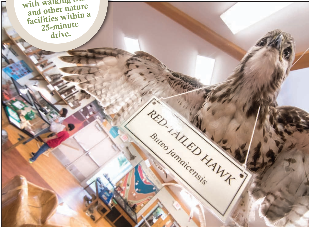
A red-tailed hawk soars above the For-Mar Nature Preserve. This educational facility is filled with native Michigan animals — living or mounted, like this hawk.

The tri-county area has two nature preserves with walking trails and other nature facilities within a 25-minute drive.