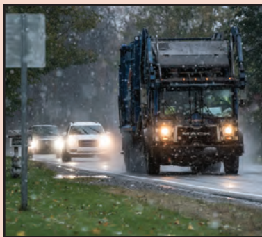
TRI-COUNTY TIMES | TIM JAGIELO

That’s the word from NBC-TV25 See SNOWY on 7