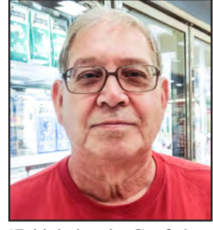
"I think that the Confederate flag should have came down due to it representing slavery and all the horrible things with it."