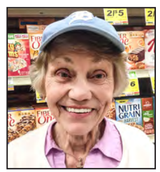
"I don't think it is racial, I see it as a part of history."