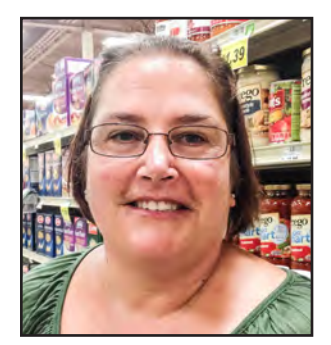
"It's a part of our history and it is in the past. We should move on."