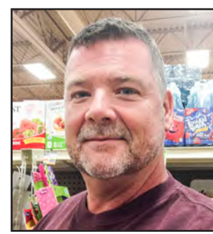
"I love it because it stands for freedom and it is history."