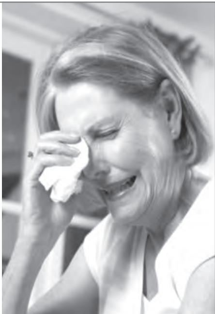
Many spontaneous reactions have an evolutionary purpose.