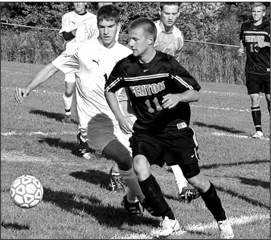
TRI-COUNTY TIMES | DAVID TROPPENS

The contest remained 1-0 until the final