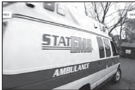
TRI-COUNTY TIMES | STAT EMS

The companies are actively working with all current Genesee County EMS staff for preferred employment opportunities, while also seeking additional Para-