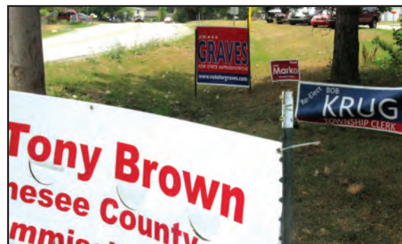
TRI-COUNTY TIMES | SALLY RUMMEL

► Political advertising is heating up as the Aug. 7 Primary Election nears. Spending on political campaigns during this presidential election year is expected to reach an all-time high.