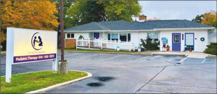
Journey Therapy Center serves families in Oakland County at their Clarkston Road location. They also have three locations in Lapeer County.