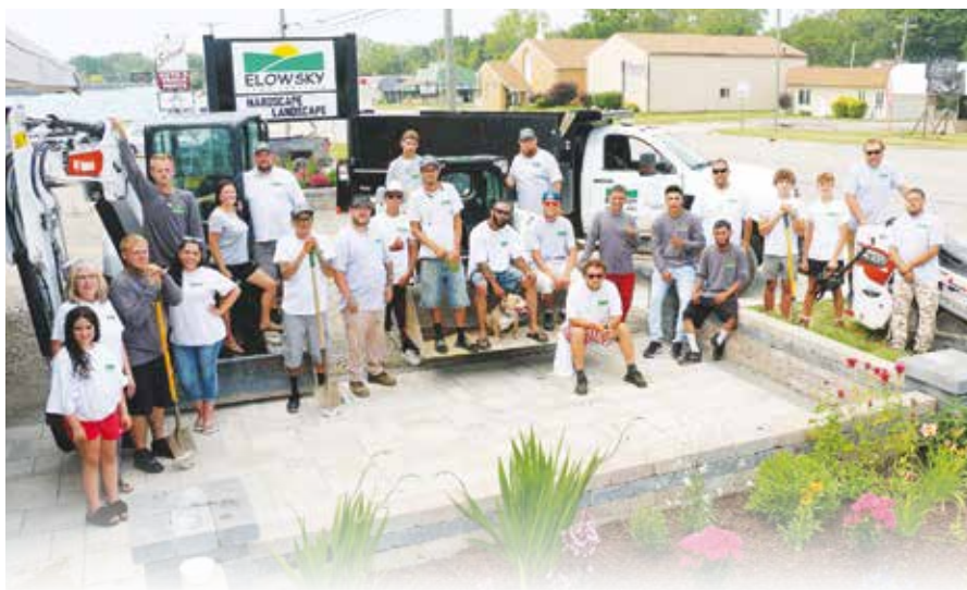
The staff at Elowsky Lawn Services at their showroom, 2527 Dixie Highway, Waterford.