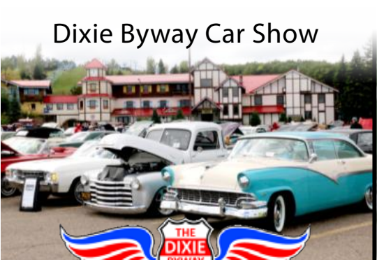
Proud sponsor of the Dixie Byway