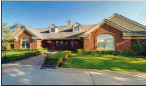
Metamora Golf & Country Club

Built in 2000 and located off of M-24 in Oxford Township, Boulder Pointe Golf Club includes three 9-hole courses, each with its own distinct feel and