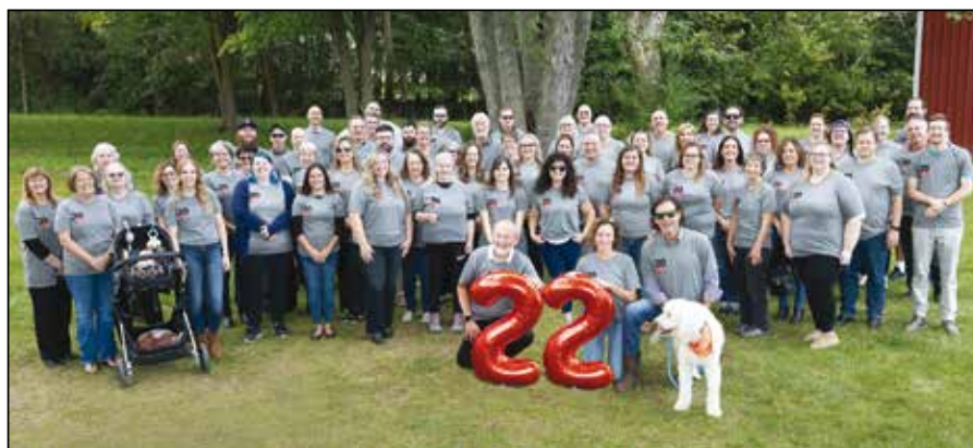
The team at View Newspaper Group, which publishes 22 papers across 14 counties in Michigan, is proud to be your community connection.

has allowed the team at View Newspaper Group to continue to give back and support community causes through signature events, editorial coverage and cash donations.