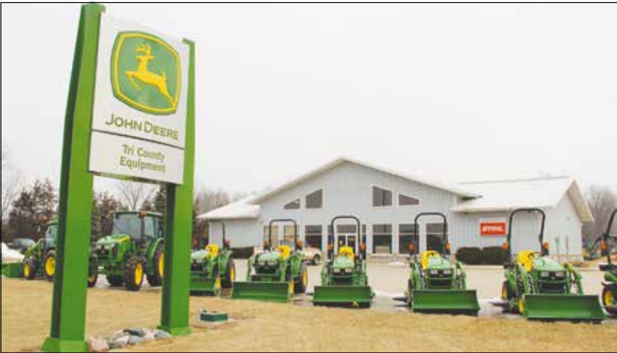
Celebrating 40 years in business, Tri County Equipment continues to serve Michigan’s agricultural, commercial, and residential equipment needs with 11 locations across the Thumb and Mid-Michigan.

main focus is agricultural equipment, including tractors, combines, sprayers, balers, and more, the company also offers a wide range of residential and landscaping products. Homeowners can find everything from John Deere riding mowers to side-by-side vehicles, as well