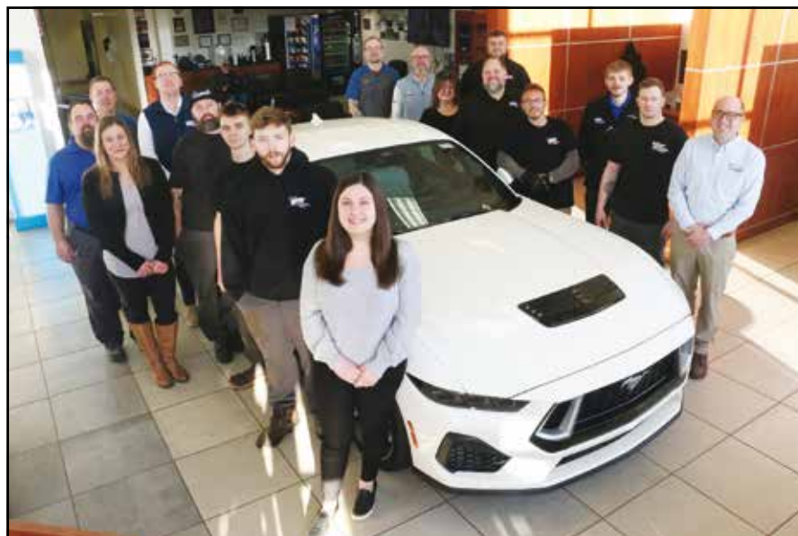
The staff at Randy Wise Ford, Ortonville

In addition, Randy Wise Ford Ortonville invested in charging station