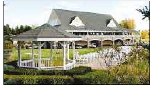
Boulder Pointe Golf Club